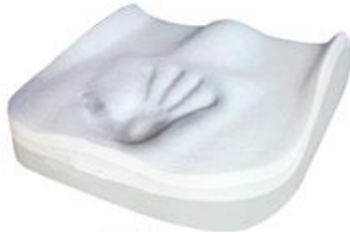
2 Memory Foam Layers